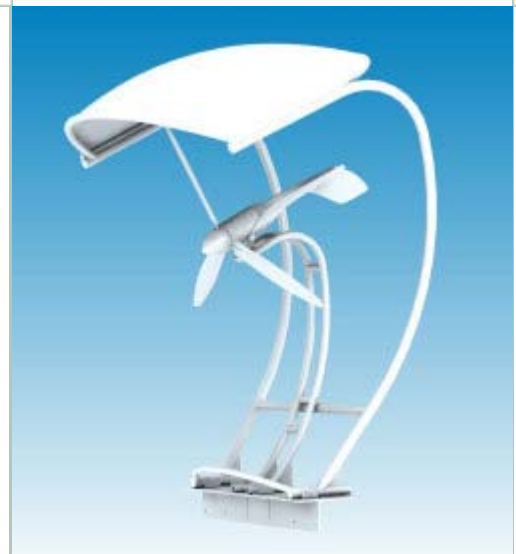
The 400-watt AVX400 turbine from AeroVironment, released in 2006 and shown