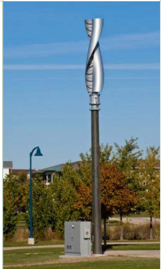
This Windside turbine is being tested by Madison Gas and Electric is nominally rated at 10 kW AC but has never produced more than 600 watts. It is installed at a height that might be typical for a rooftop application.

A 2008 report on 19 small wind turbines installed in Massachusetts, written by the Cadmus Group with support of the Massachusetts Technology Collaborative, found far lower performance than expected. While these were freestanding rather than building-integrated turbines, the measured capacity factor was just 4%, versus the projected 10%. In other words, the performance was 60% worse than predicted. Various reasons were given as to why this large discrepancy may exist, including inaccurate wind speed estimates, incorrect power curves, inverter inefficiencies, and greater losses due to site conditions (turbulence and wind shear) than expected.