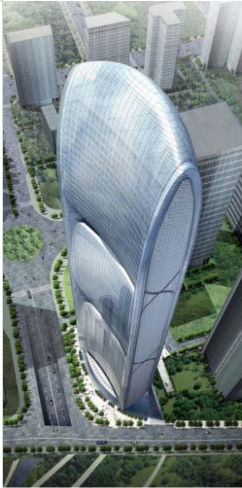
The Pearl River Tower will include four vertical-axis turbines located in penetrations through the face of the building.

If you try to put a turbine on a tower on top of a building—to get away from the turbulent flow and into the most productive wind—the stresses on the building are magnified. Randy Swisher, the past executive director of AWEA, notes that wind turbines are subjected to a great deal of stress, and if installed on a building, “that stress can be transmitted to the building structure, creating substantial problems.”