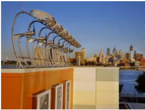
The Adventure Aquarium in Camden, New Jersey, features eight 400-watt and four 1000-watt AeroVironment turbines.