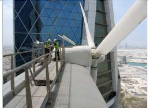
The Bahrain World Trade Center, with three 225 kW turbines on bridges spanning the twin towers, is the first building to integrate commercial-scale wind turbines into a building.

It turns out that, despite some benefits, building-integrated wind doesn't make much sense as a renewable-energy strategy. In this article, we'll examine both the pros and cons of this technology, look at some examples of how it's been tried, and explain why it's usually a bad idea.