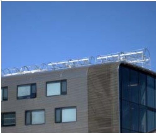
These helical Aerotecture turbines on a building in Chicago have been operating only sporadically.