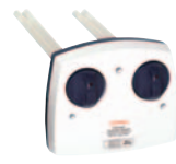
Whole-House Ultraviolet Treatment